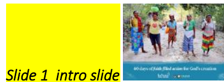
Slide 1 intro slide

Yellow highlights are presenter notes – large text is for reading.