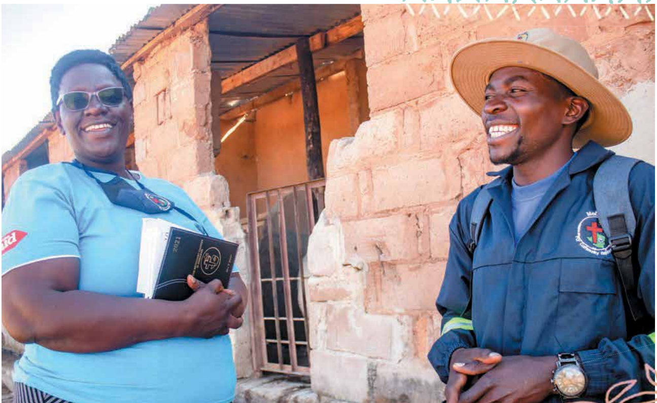
A team from the Methodist Development and Relief Agency visit a project in rural Zimbabwe.

"I now enjoy my sermons as I feel that I am imparting the word of God to everyone without leaving anyone behind."