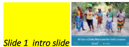
Slide 1 intro slide

Yellow highlights are presenter notes – large text is for reading.