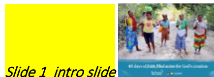
Slide 1 intro slide

Yellow highlights are presenter notes – large text is for reading.